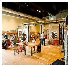
Children's Museum of Pittsburgh

Our Innovators Lab will provide projects for children of different ages and open times so children can create anything they can imagine. The space will foster self-directed, hands-on, and collaborative learning. In addition, the Innovators Lab will reflect exhibits that will allow in-depth discovery.